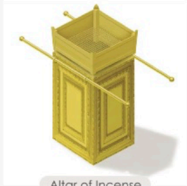
Altar of Incense