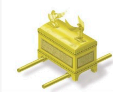
Ark of the Covenant