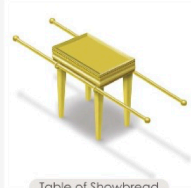
Table of Showbread