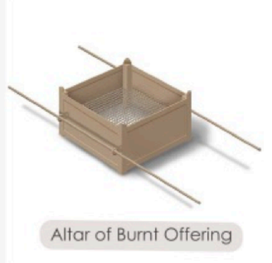
Altar of Burnt Offering